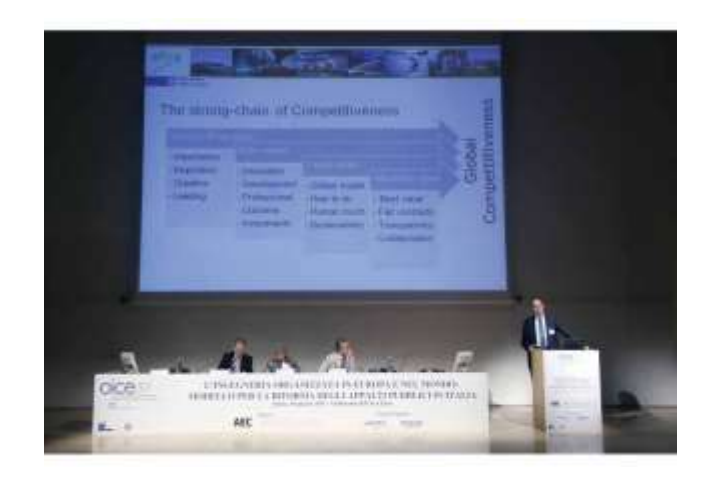
SYNTEC-Ingénierie stages 14<sup>th</sup> annual meet.ING at World Efficiency

FIDIC presented best practices in international contracting.